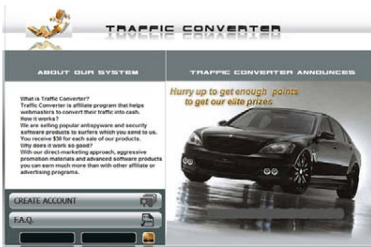
Figure 3. Traffic Converter website

tools such as advertisements, malicious code executable files, and email templates, as well as obfuscation tools to help keep the scams from being exposed.