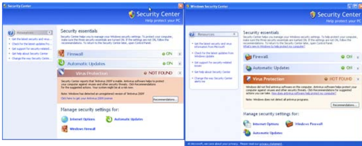
Figure 2. AntiVirus 2009 Security Center (left) vs. legitimate Windows Security Center (right)

legitimate antivirus software programs (figures 1 and 2). The majority of these programs also have fully developed websites that include the ability to download and purchase the software.